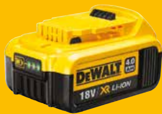
DCB182-XJ 18V XR 4.0 Ah battery