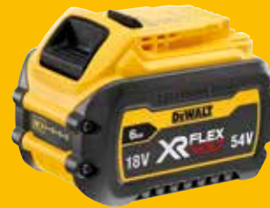
DCB546-XJ 18V/54V 6.0/2.0 Ah battery