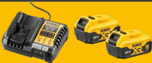
DCB1104P2-QW Starter kit 2 x 5.0 Ah, 1 X DCB1104