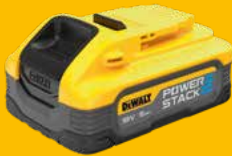
DCBP518-XJ 18V XR 5.0 Ah POWERSTACK battery