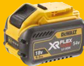
DCB547-XJ 18V/54V 9.0/3.0 Ah battery