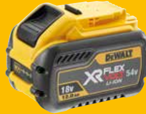
DCB548-XJ 18V/54V 12.0/4.0 Ah battery