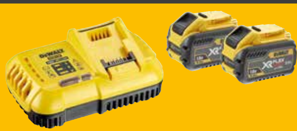
DCB118X2-QW Starter kit 2 x 9.0 Ah, 1 X DCB118