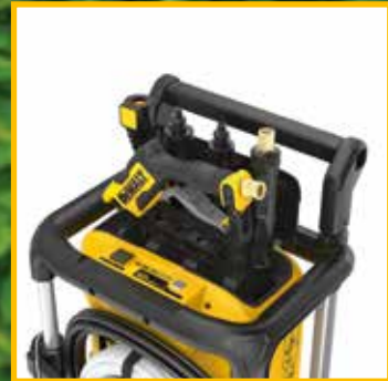
ON BOARD ACCESSORY STORAGE.