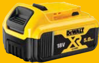
DCB184-XJ 18V XR 5.0 Ah battery