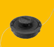
DT20656-QZ Grass trimmer spool and 7,8 mt line, 2 mm for DCM561PBS/DCM561/DCM571/DCM5713/DCMAS5713/DCMASST1N/DCMASBC1N