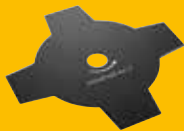
DT20655-QZ Brushcutter 4T blade (230 mm) for DCM571